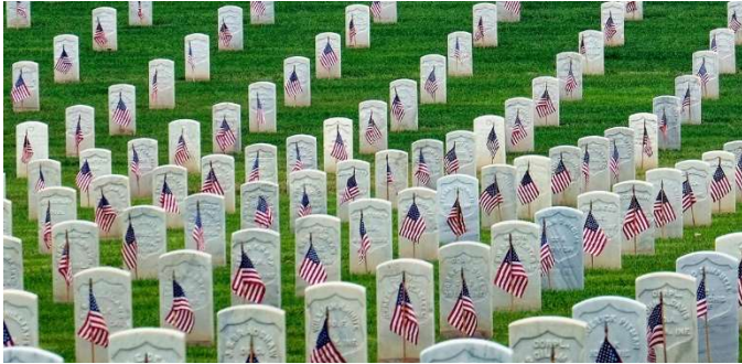
Typical memorials are all across America.

This time of year, we see more American flags than the rest of the year. The season starts with Memorial Day, then Flag Day and completes with the Fourth of July. National Cemeteries all over the country have arrays of flags and moving ceremonies. Our own Bay Pines Veterans Cemetery is decorated with small flags at each grave marker by veterans' organizations and Boy Scouts.