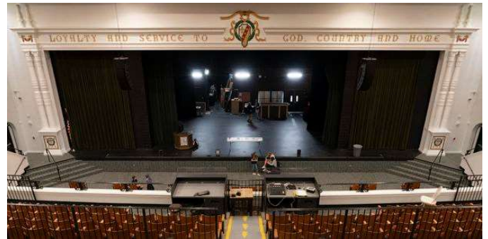
The auditorium's restoration is impressive.