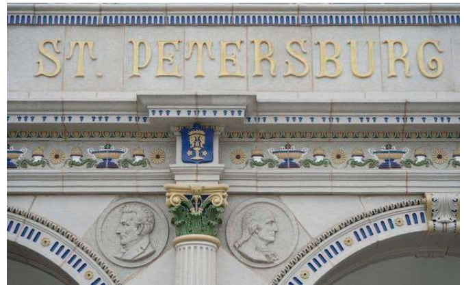
Detail of the restored front entrance.

It is fitting that this building has been saved for future generations.