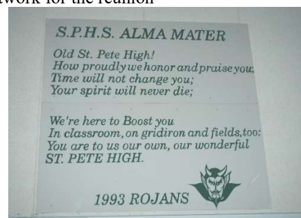
Alma Mater on display in the school museum-former library.